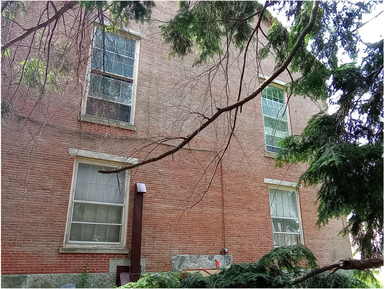
Rear (north) elevation