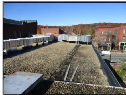
Photo R2 — Overview of main Shea Theater low-slope roof with deteriorated concrete paver walkway across roof.