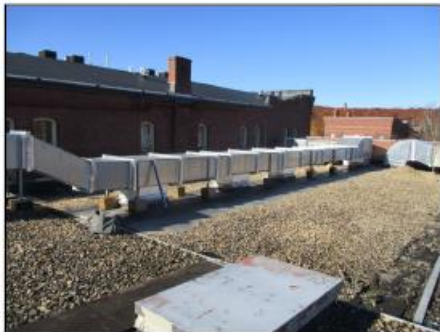
Photo R1 — Overview of main Shea Theater roof. Note ballast stone pulled away from base of duct work.

This project was recommended unanimously by the Montague Capital Improvements Committee (5-0), Finance Committee (6-0), and Selectboard (2-0).