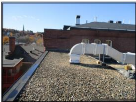
Photo R3 — Overview of rear raised roof at the rear of Shea Theater.