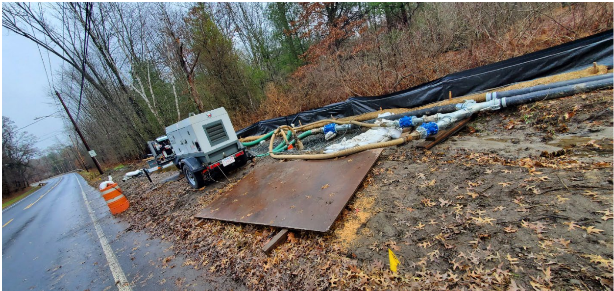
Flooding Relief Project at Montague City Road- Fall 2023

Funded with support from FEMA Natural Hazard Mitigation Grant, Municipal Vulnerabilities Preparedness Program, and Town Capital Stabilization