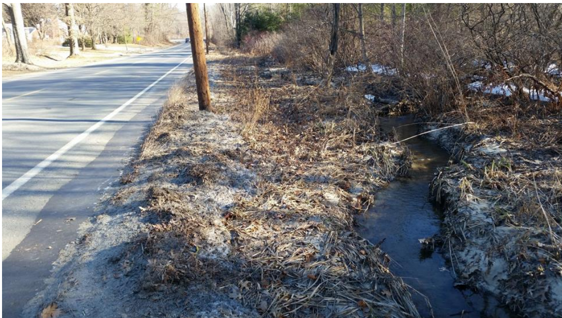
Perennial stream running along Montague City Road, February 2018

Responses due to Montague Selectboard Office no later than