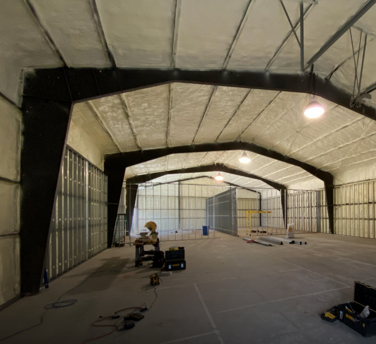
Maine Phase 1