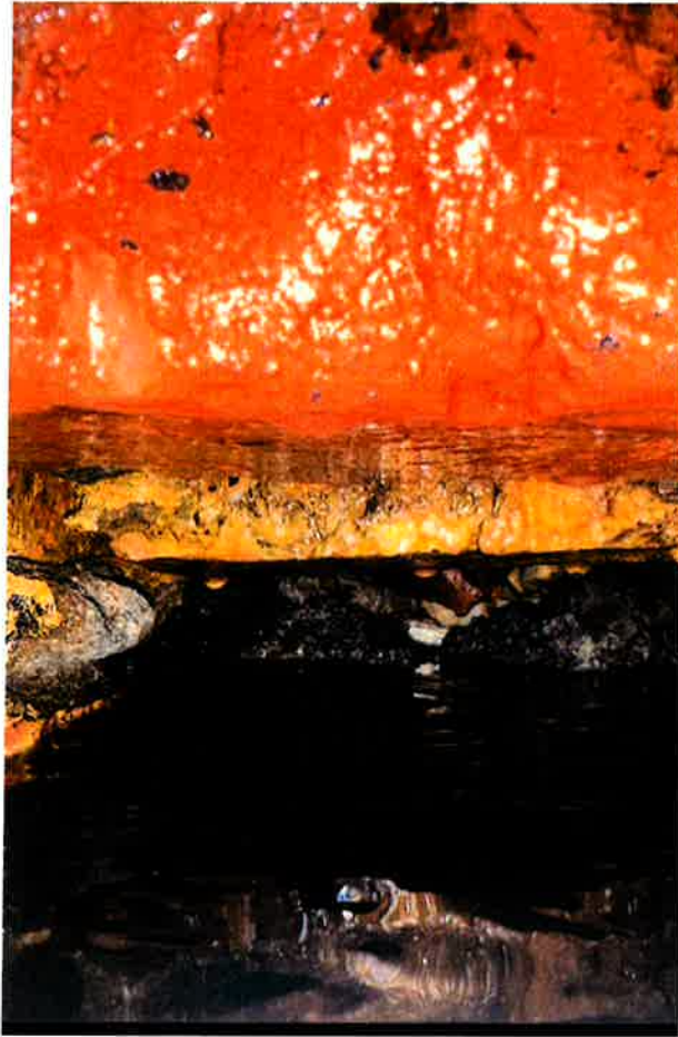
Image of collapse point of clay sewer pipe under Montague City Road 10/25/2022

The Town of Montague is an equal opportunity provider and employer