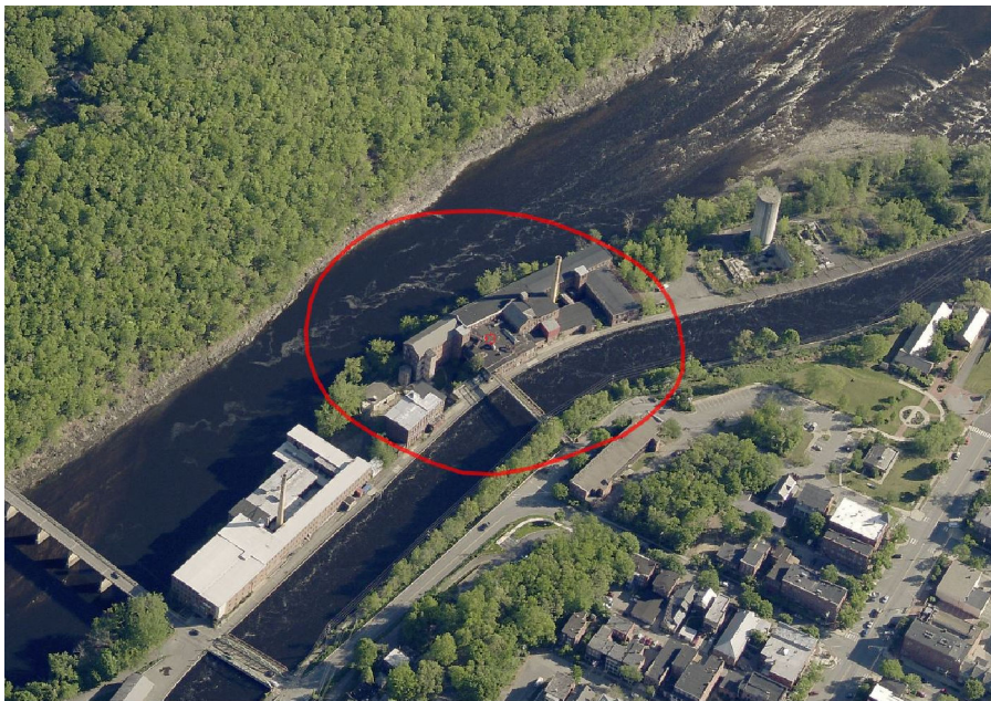
Pictometry Aerial Photo 2017