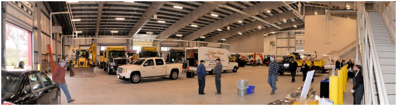
Montague Department of Public Works- Main Bay